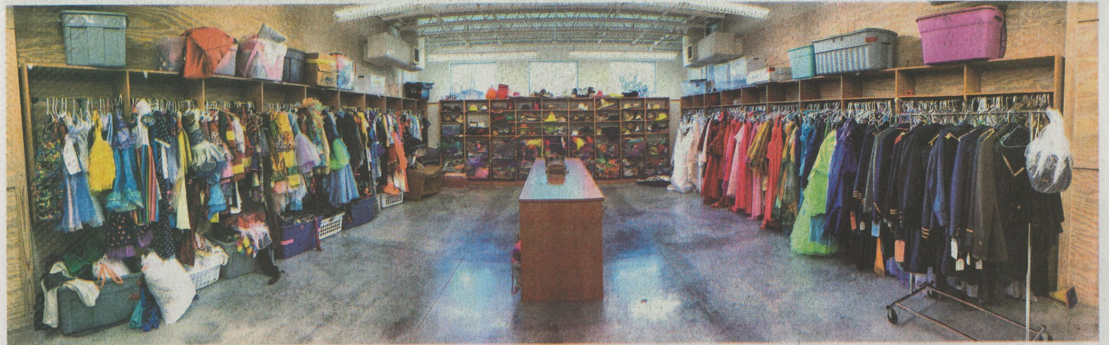
The costume room inside Star Place has everything you need to dress the part, no matter the occasion.