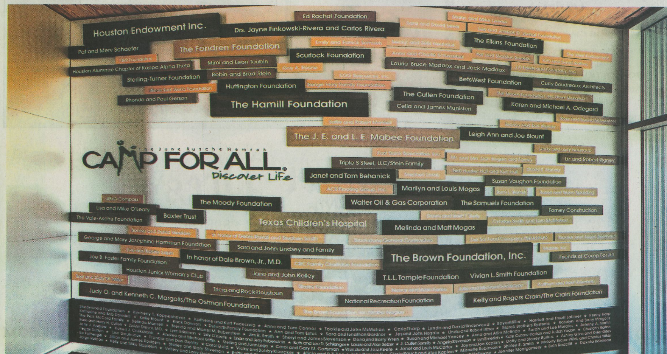
The Tree House at Camp For All is a fan favorite among campers and staffers alike. The pathway is wide enough to roll a wheelchair along the pathway that overlooks a ravine full of wildlife.

A photograph showing a wooden boardwalk with railings leading through a dense forest. The boardwalk is made of wooden planks and has a dark railing. It curves to the right and then straightens out, overlooking a body of water. The forest is lush with green trees and foliage. The water is visible in the distance, surrounded by more trees. The overall scene is peaceful and scenic.